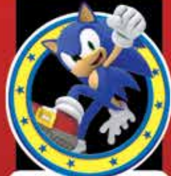
SONIC THE HEDGEHOG FASTEST THING ALIVE